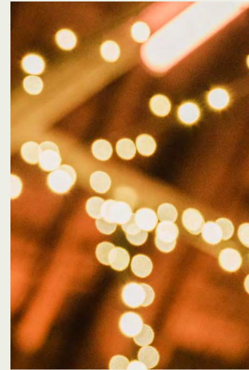
Out with a BANG!

Playa del Carmen Paradisus La Perla (adults only) $7,800 USD Extra guest $180 USD