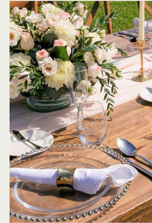
Designed by Destination

Playa del Carmen Paradisus La Perla (adults only) $15,000 USD Extra guest $240 USD