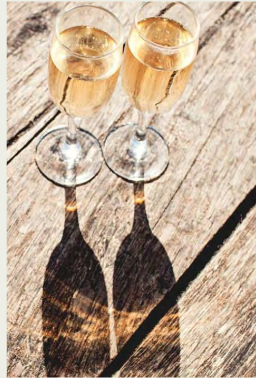
It Takes Two or a Few