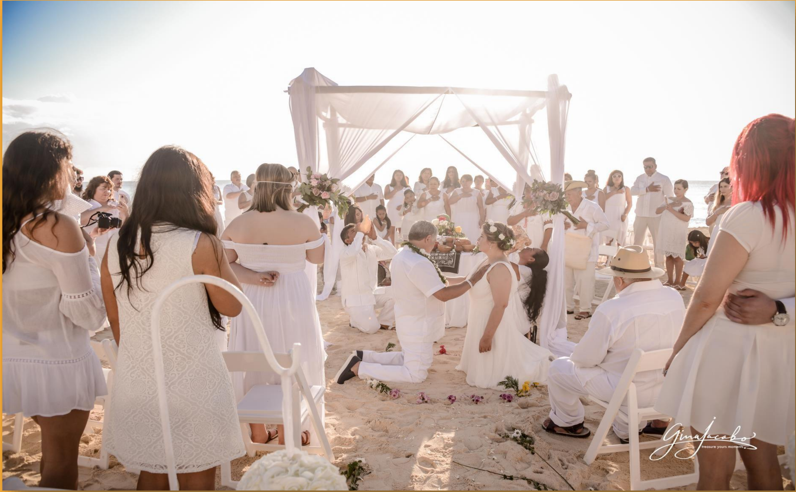
Mayan Ceremony, up grade décor