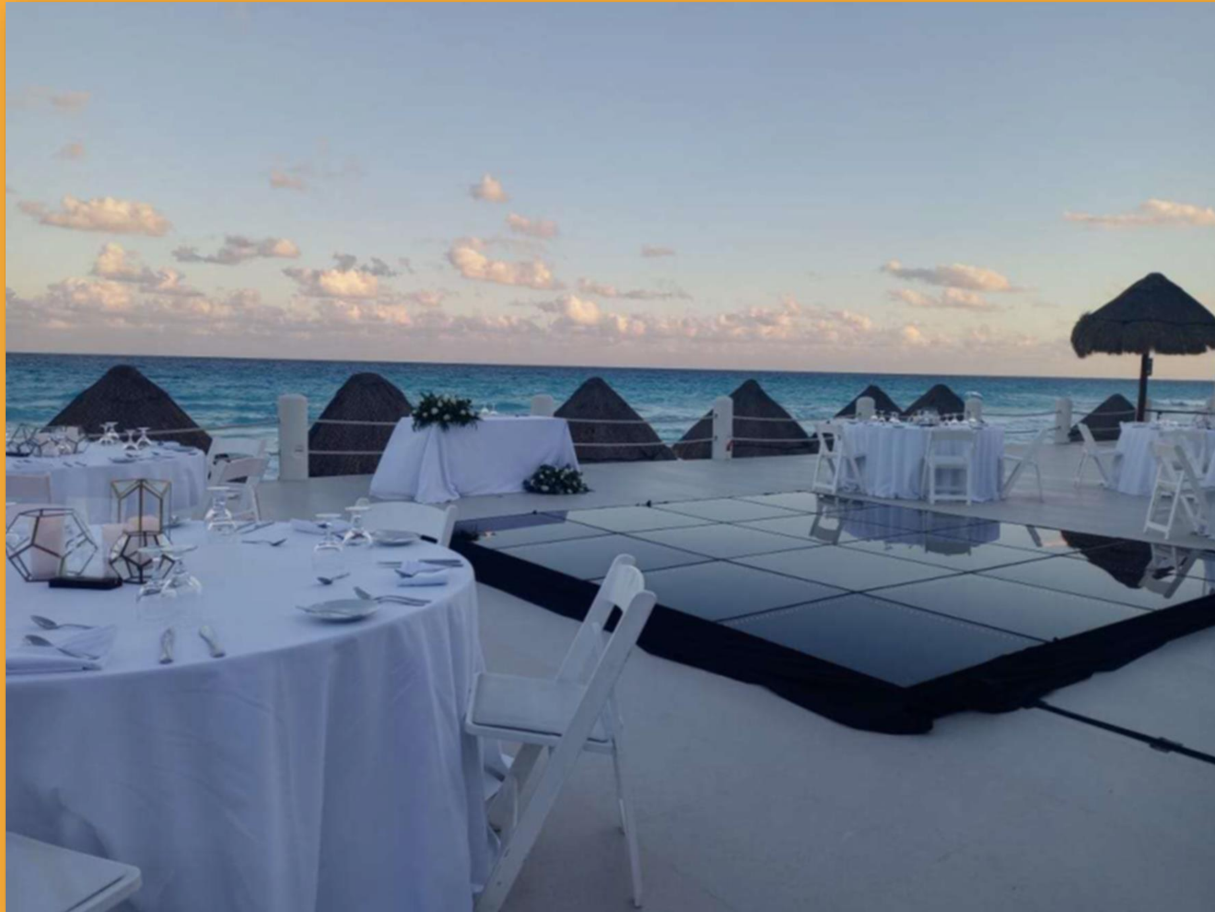
Banquet set up in Luna terrace, assorted décor options available.