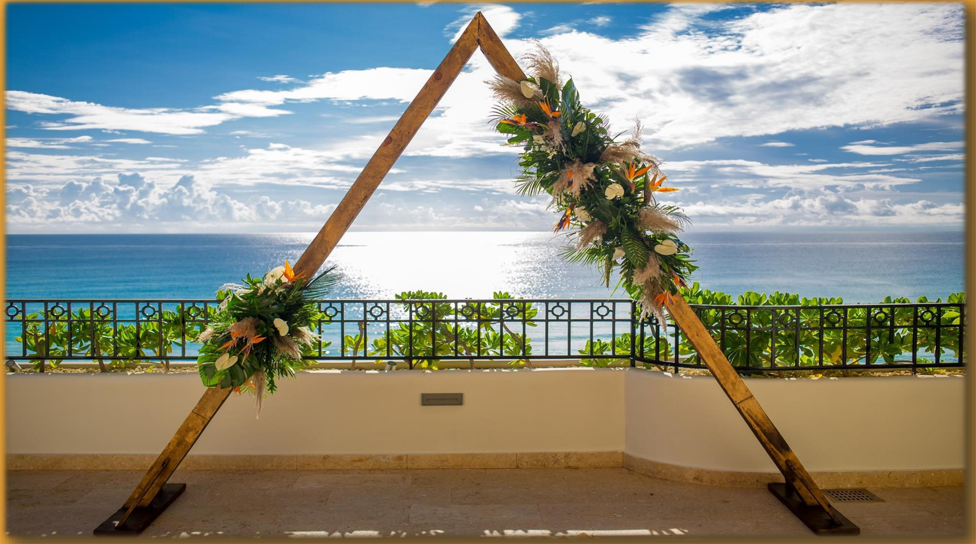
Presidential Suite terrace for 20 people, up grade décor