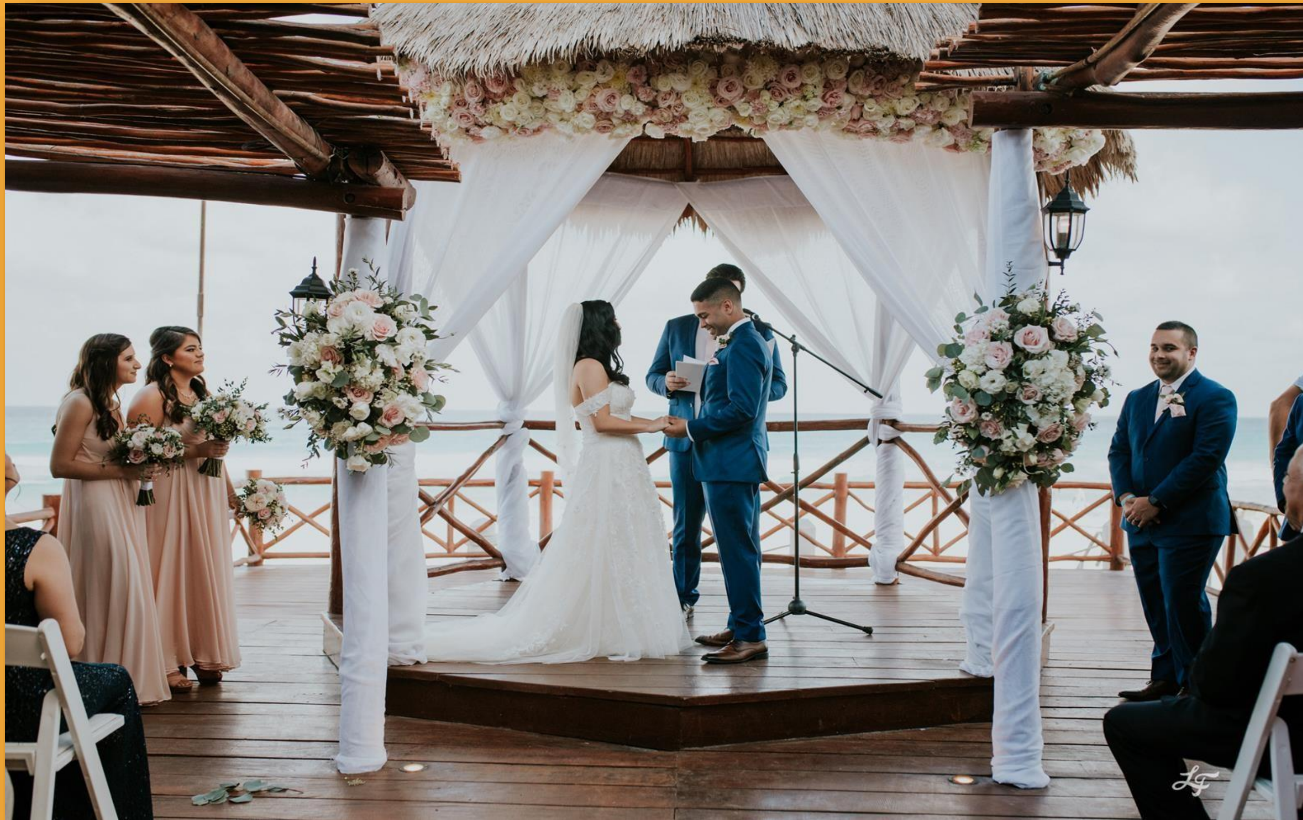
Ceremony at the Gazebo Deck, location fee $400usd up grade décor available