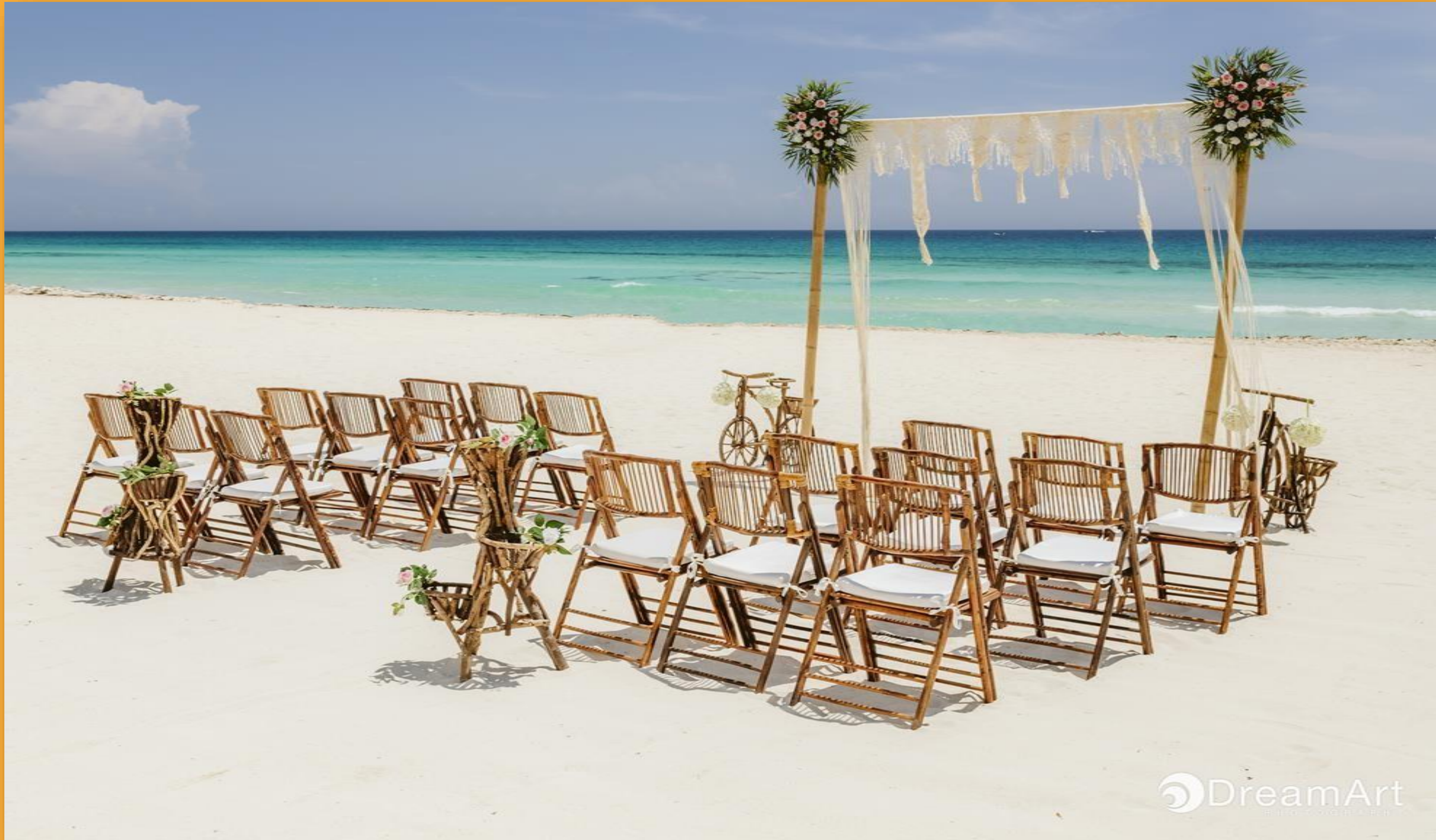
Ceremony by the beach, up grade décor