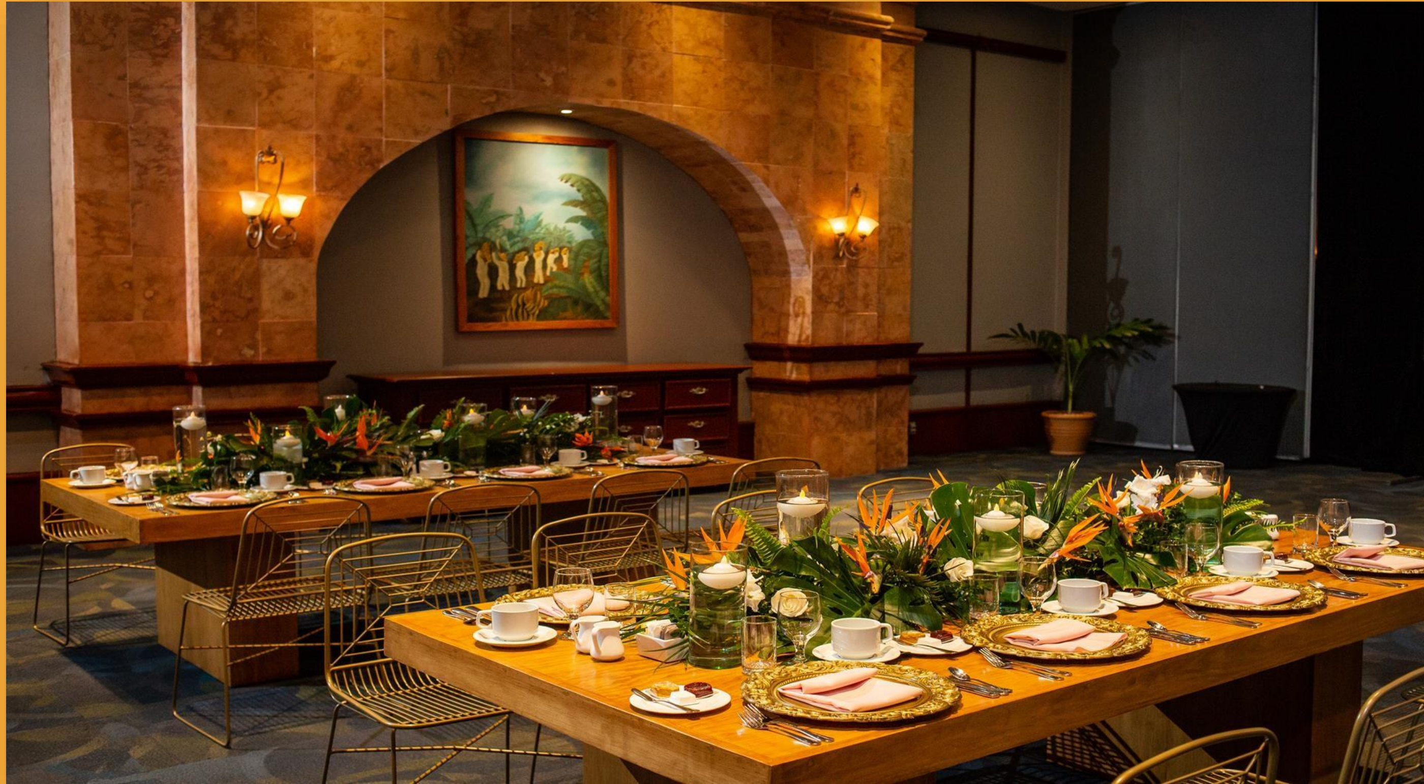
Banquet at ballroom, up grade décor available