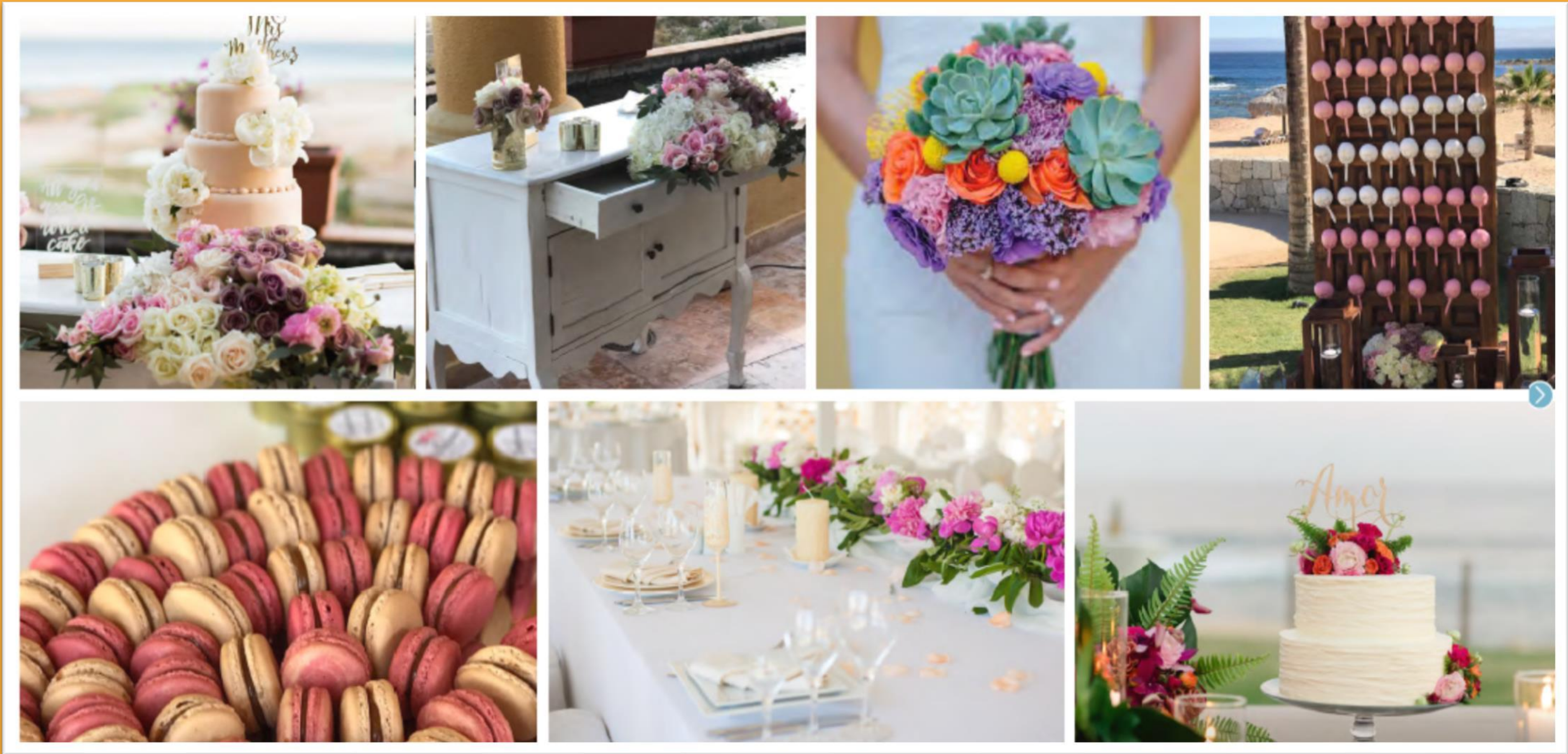
Inspiration board, up grade décor