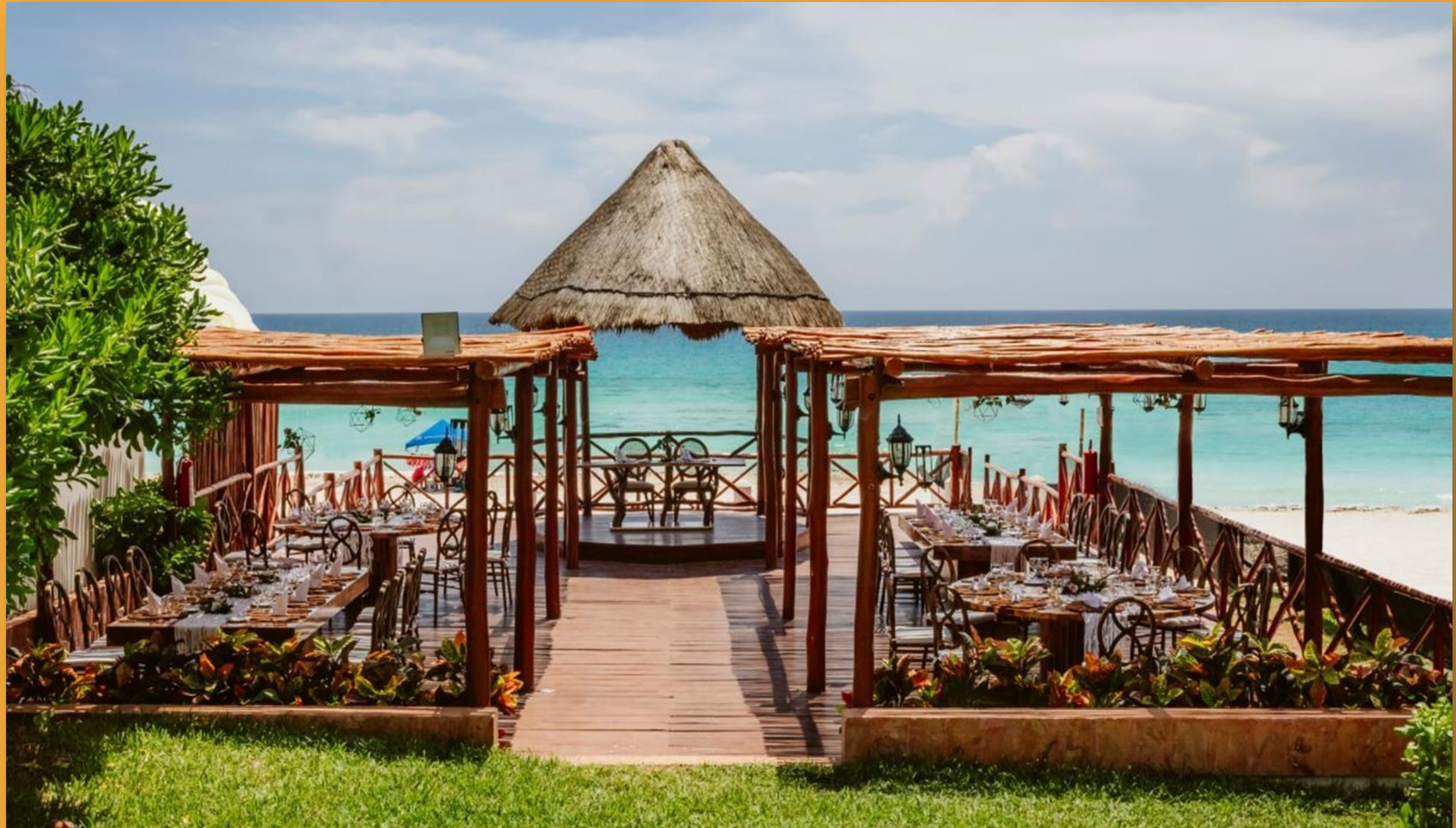
Gazebo Deck fee $400usd, up grade décor available