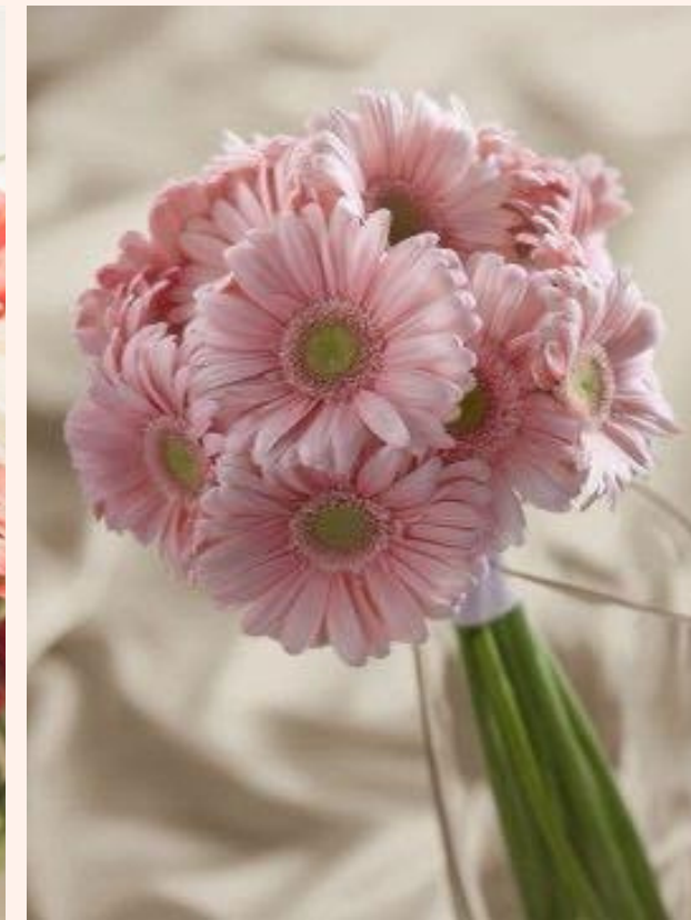
BQT-5 GERBERA (ONE COLOR)