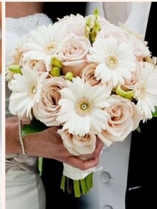
BQT-21 ROSES & DAISIES