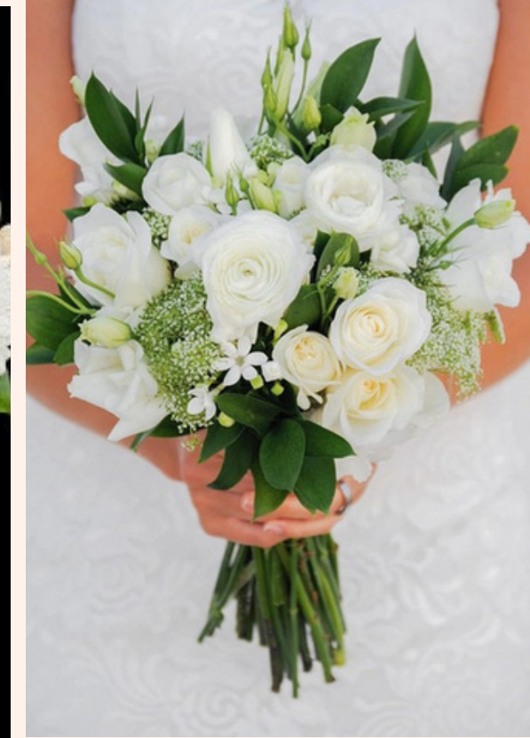
BQT-22 ROSES & LISIANTHUS