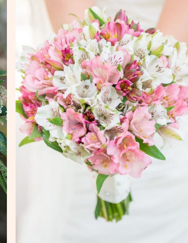
BQT-30 MIXED ASTROEMELIA 19