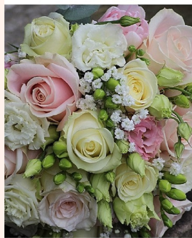
BQT-25 ROSES & KALANCHOE