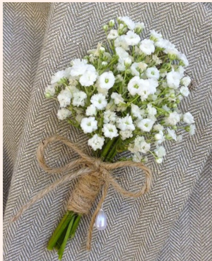
BOU-8 BABY BREATH