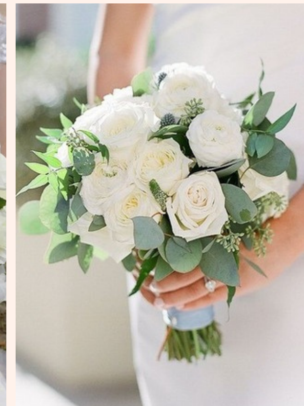
BQT-11 ROSES & EUCALYPTUS