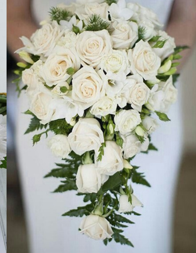
BQT-27 ROSES CASCADING