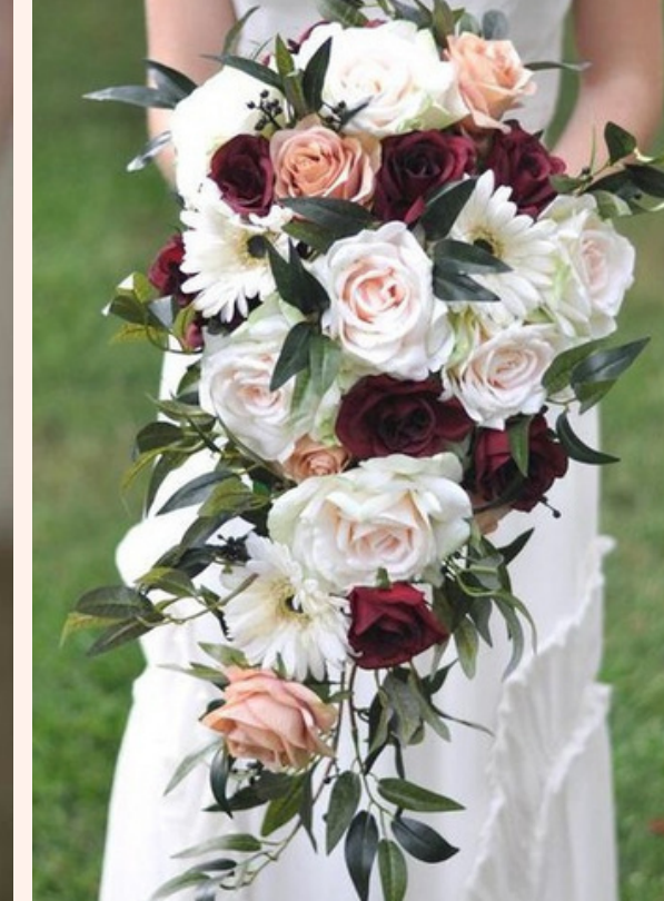
BQT-28 MIXED ROSES CASCADING