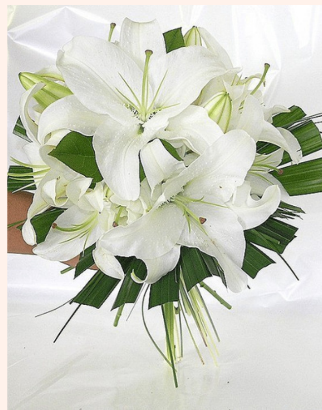
BQT-13 LILIES (ONE COLOR)