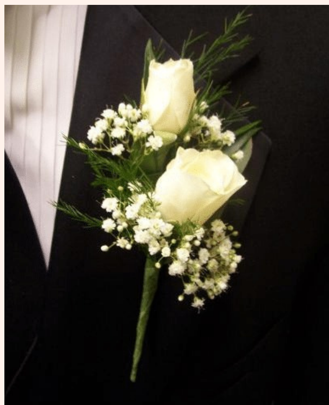
BOU-14 MINI ROSES & BABY