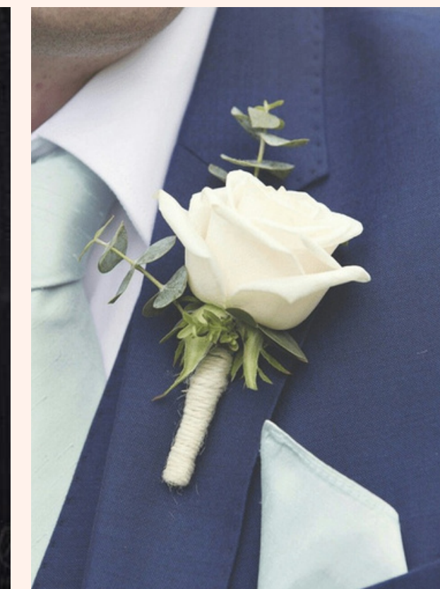
BOU-18 ROSE & EUCALYPTUS 21