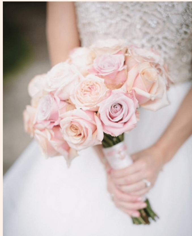
BQT-2 ROSES (TWO COLORS)