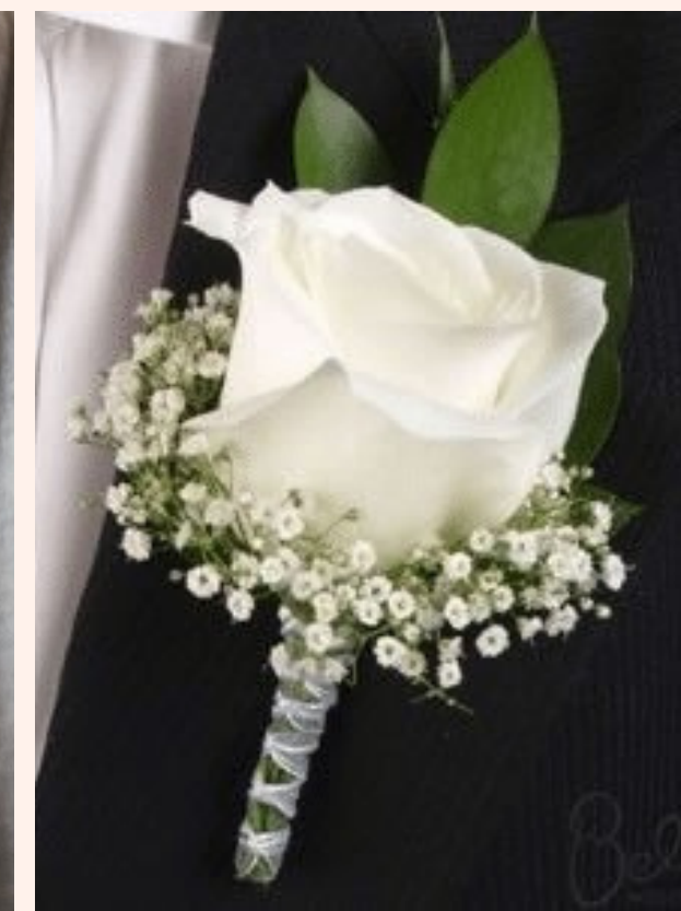
BOU-17 ROSE & BABY BREATH