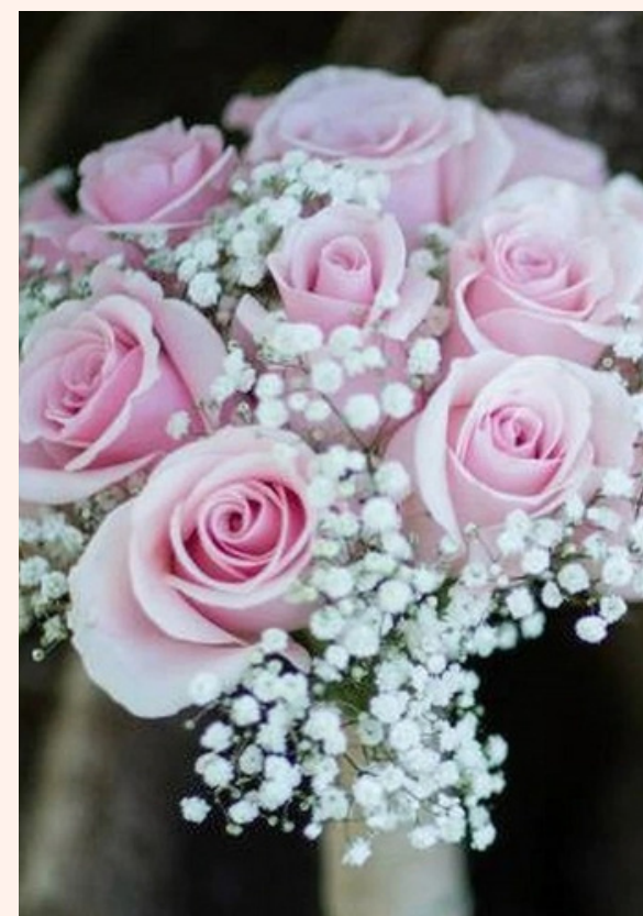
BQT-16 ROSES & BABY BREATH