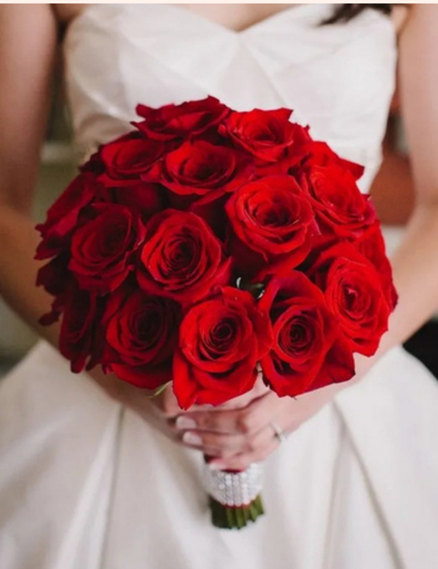
BQT-1 ROSES (ONE COLOR)

Prices are in usd dollar subject to 16% tax (some flowers are seasonal)