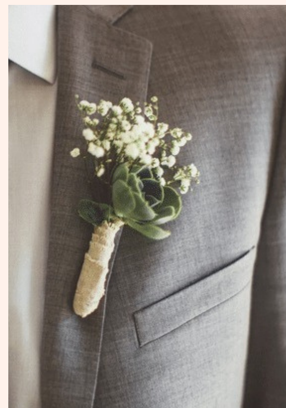
BOU-16 EUCALYPTUS & BABY BREATH