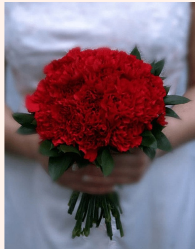
BQT-7 CARNATION (ONE COLOR)