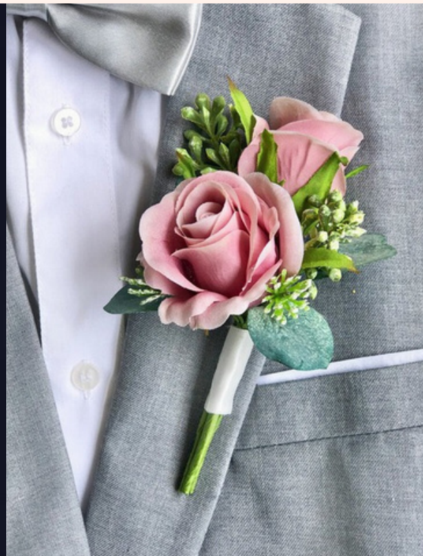
BOU-2 MINI ROSES