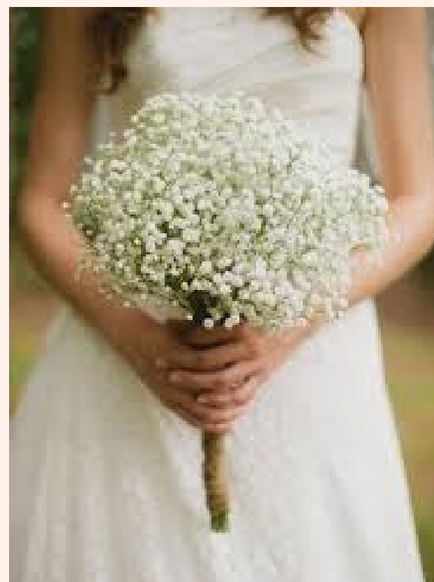
BQT-15 BABY'S BREAT