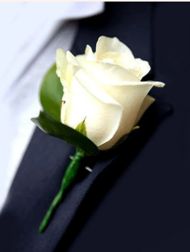
BOU-1 ROSE S

Prices are in usd dollars subject to 16% tax, some flowers are seasonal.