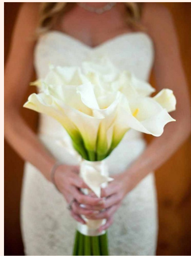
BQT-9 ALCATRAZ (ONE COLOR)