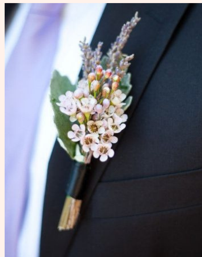
BOU-13 WAX FLOWER