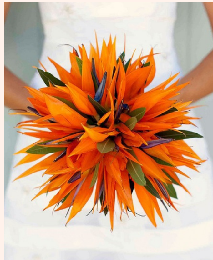
BQT-20 BIRDS OF PARADISE