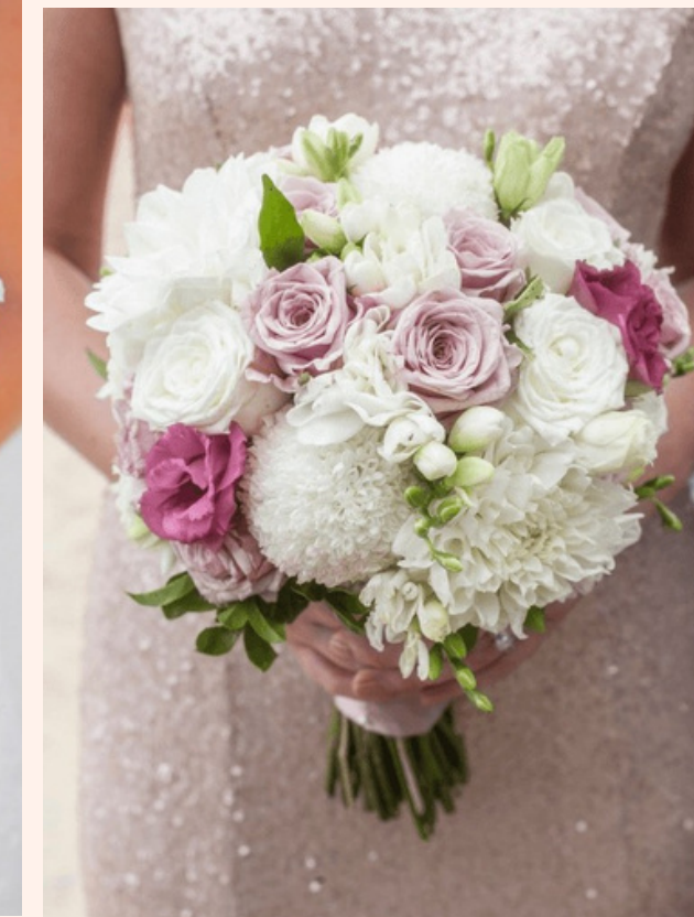
BQT-23 ROSES & CHRYSANTHEMUM