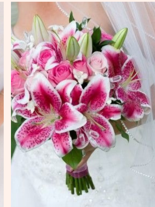
BQT-12 ROSES & LILIES