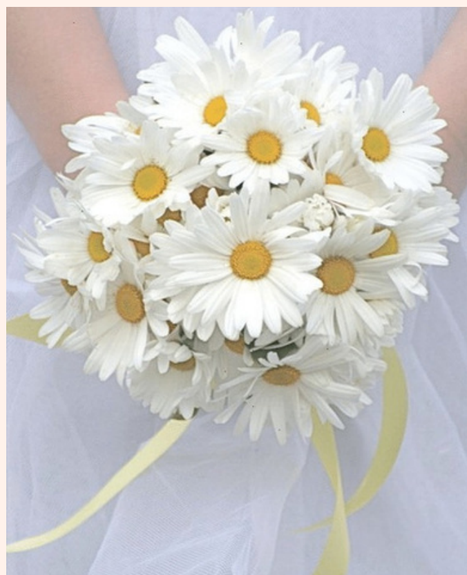
BQT-14 DAISIES (ONE COLOR)