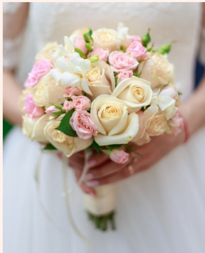
BQT-8 ROSES & MINI ROSES