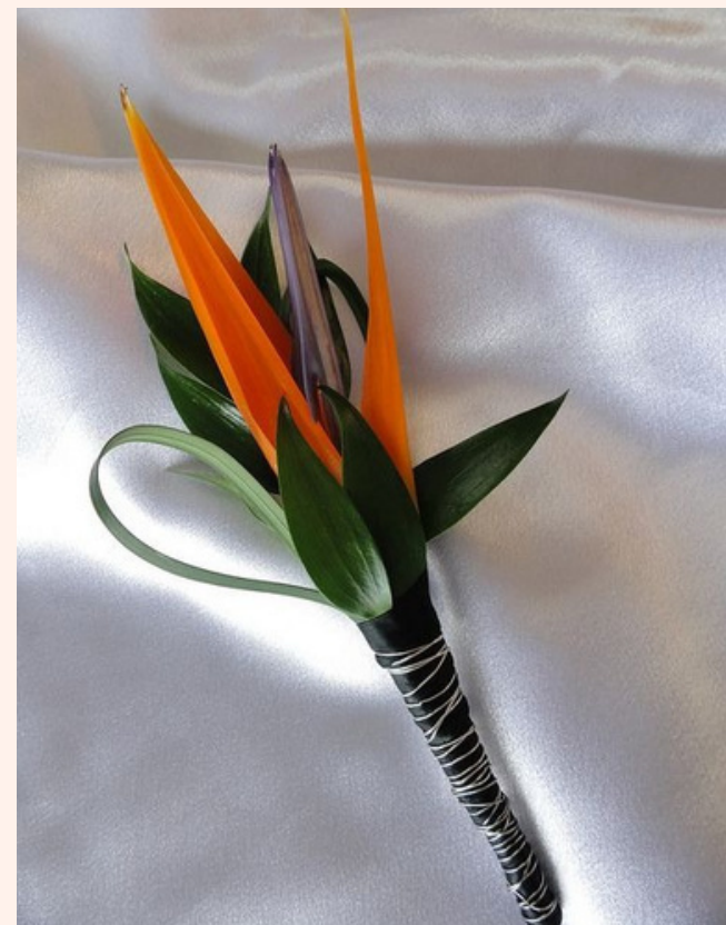
BOU-7 BIRD OF PARADISE