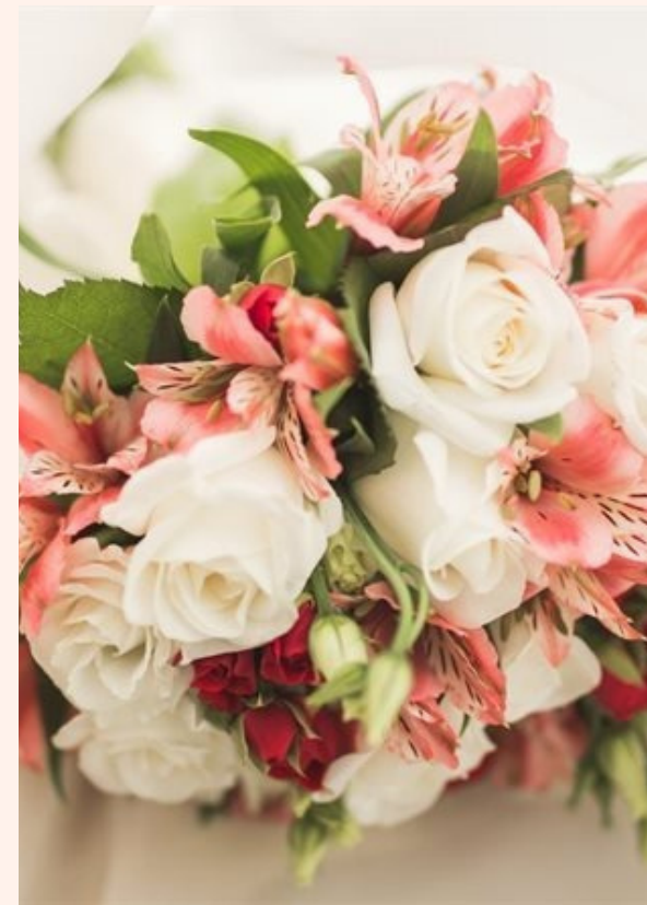
BQT-4 ASTROEMELIA & ROSES