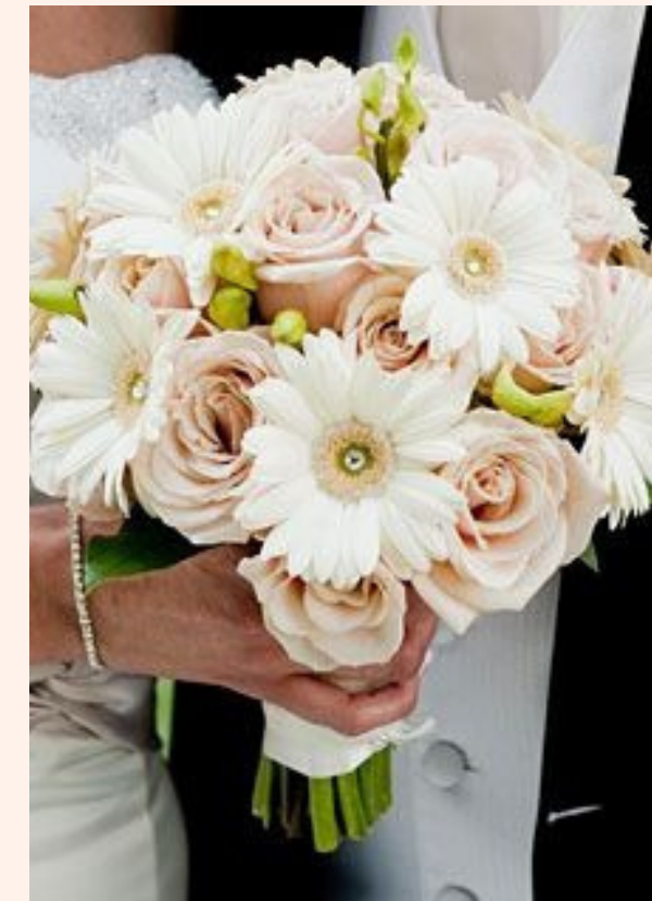
BQT-6 GERBERA & ROSES