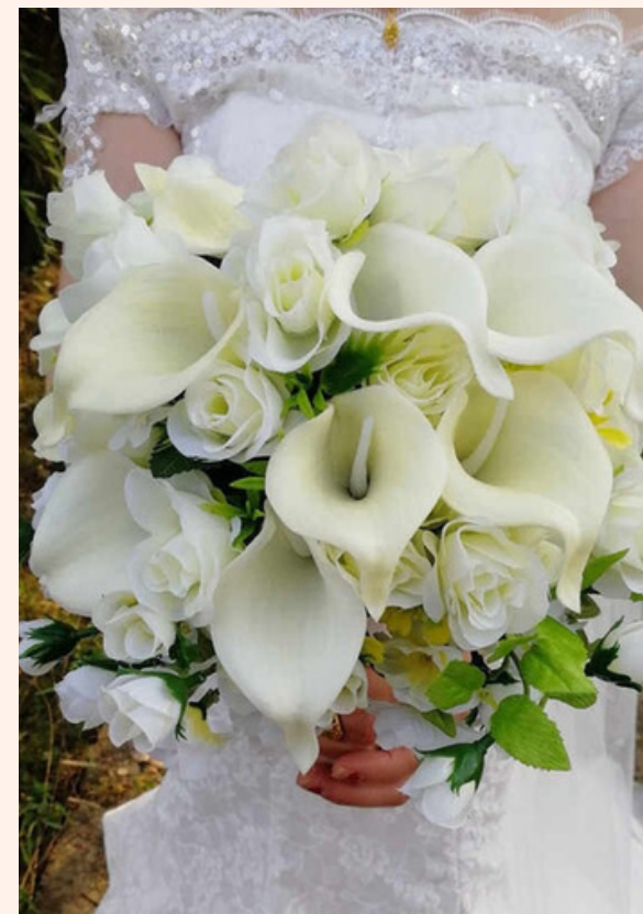
BQT-10 ALCATRAZ & ROSES