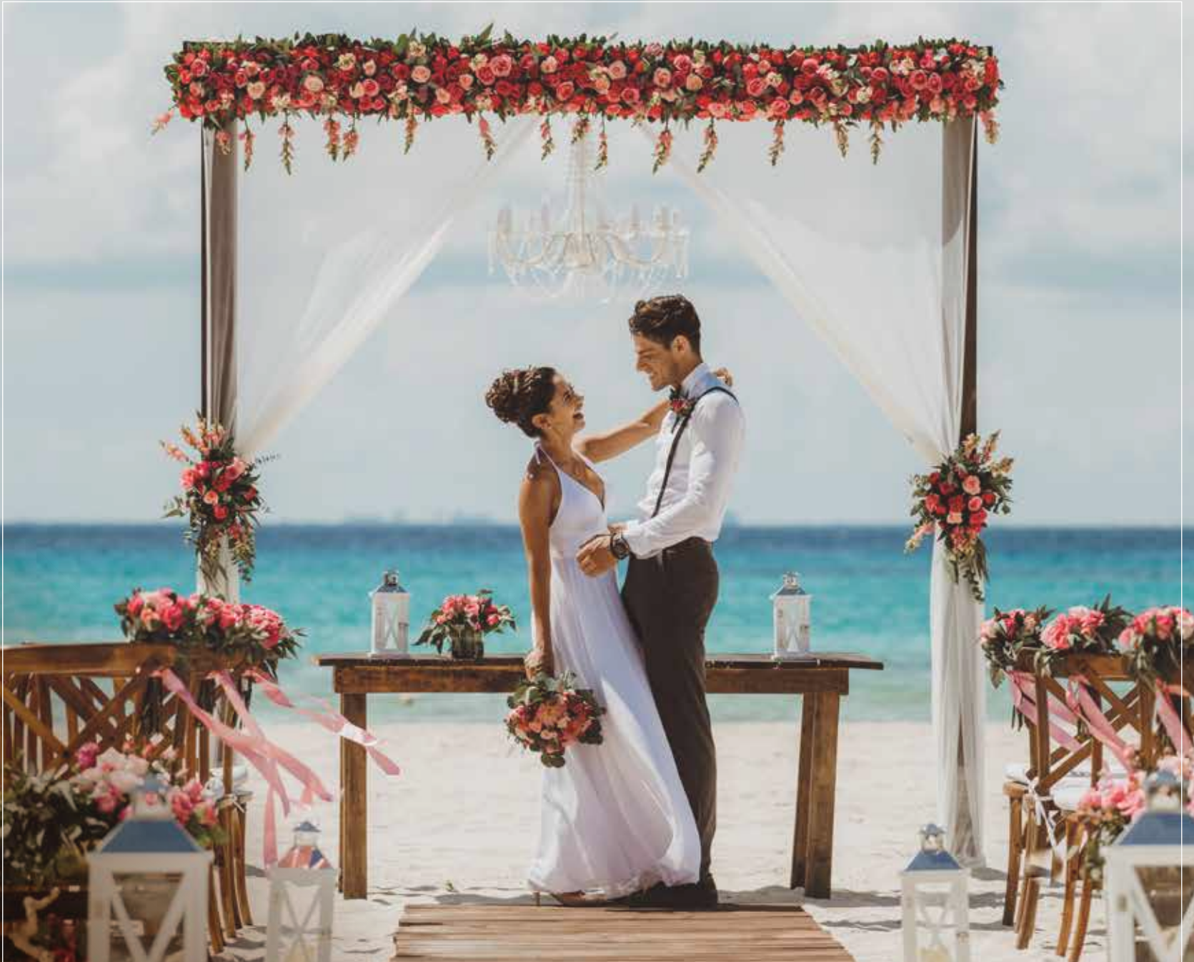
Illustrations may depict upgraded setups.